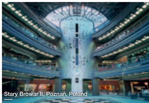
Stary Browar II, Poznań, Poland